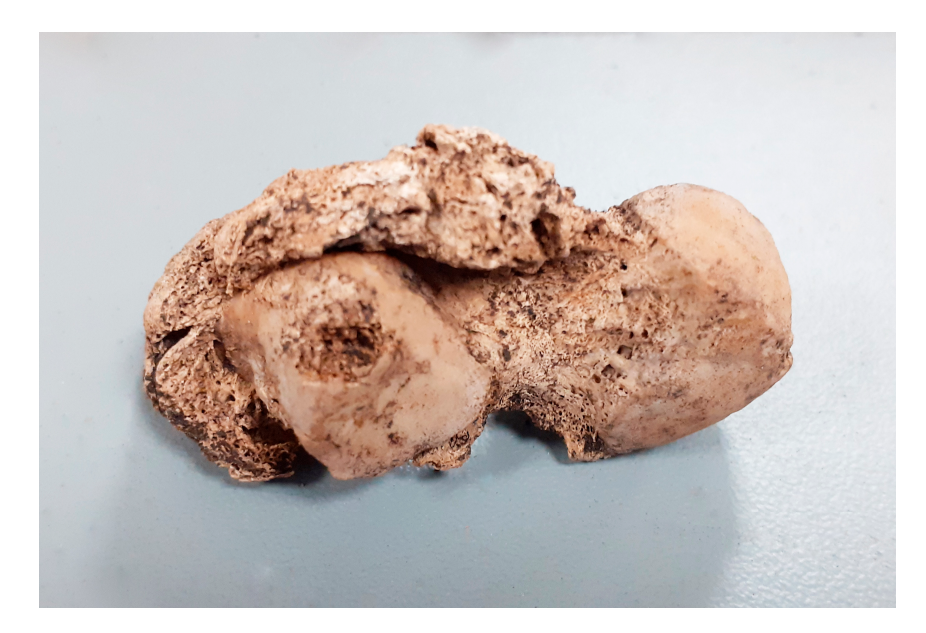
Figure 4. Gdańsk, site 1 (Sukiennicza St.). New bone in the rib neck and rib shaft area. Condition after fracture (11th–mid 12th c.).