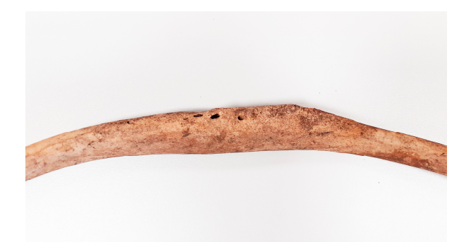
Figure 6. Gdańsk, site 1 (Sukiennicza St.). Post-infectious lesions with visible fistulas (11th–mid 12th c.).