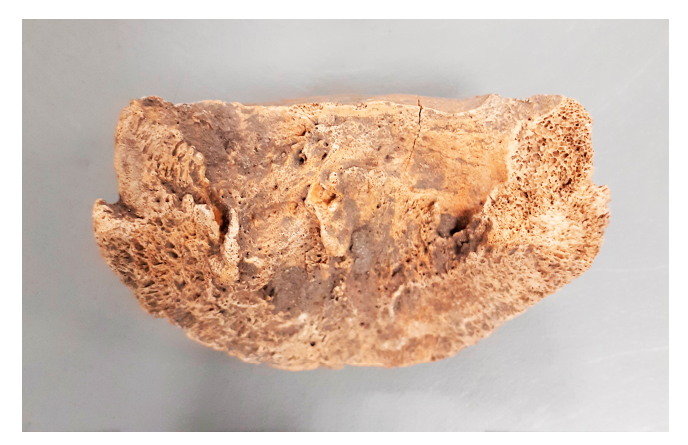
Figure 10. Gniezno, site 40. Subchondral cyst and post-inflammatory osteophytes on the proximal aspect of phalanx media (2nd half 11th–1st half 14th c.).

In one phalanx distalis, lesions were observed on its flexor surface at the terminal attachment of the deep flexor muscle of the fingers (m. flexor digitorum profundus). These are bony outgrowths on the flexor surface of the phalanx distalis, which result from damage to the tendon of the superficial flexor muscle of the fingers or to the distal uncinate ligament. In one phalanx media, a subchondral cyst was observed in the proximal aspect (Figure 10). In addition, manufacturing changes were observed as a consequence of a chronic inflammatory process (Figure 11).