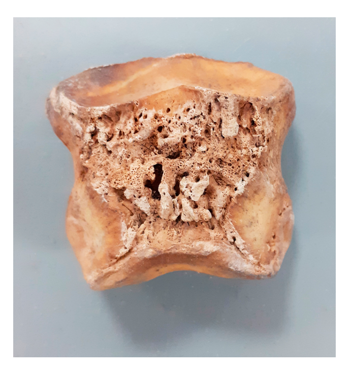
Figure 11. Massive osteophytes on the phalanx media.