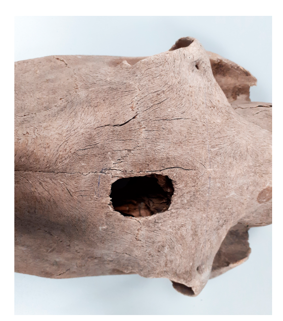
Figure 12. Ostrów Lednicki, site 2. Post-traumatic defect in the frontal bone (11th-mid 12th c.).

Within the head, 59 lesions were identified, of which 16 involved skull bones and the remaining teeth. In one case (Ostrów Lednicki, site: 2, inv. no.: I/87/13/99), a cavity in the skull caused by a large diameter sharp tool was identified (Figure 12). The hole was located on the left frontal bone, just above the nasal bone. The injury penetrated deep into the skull, destroying the auricles and part of the situs bone. If kicked, the situs bone would not have perforated, and only the frontal bone would have been damaged and would probably have been crushed. This wound appears to have been the cause of death, as injury to the situs bone causes extremely heavy bleeding. Horses were not slaughtered in such a brutal manner, and therefore, the animal suffered such a wound during a battle episode. The tool with which the wound was inflicted could have been, for example, a battle hammer [22].