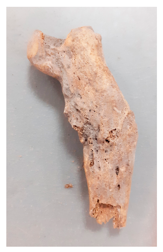
Figure 3. Kałdus, site 3. Healed rib fracture (10th–12th c.).