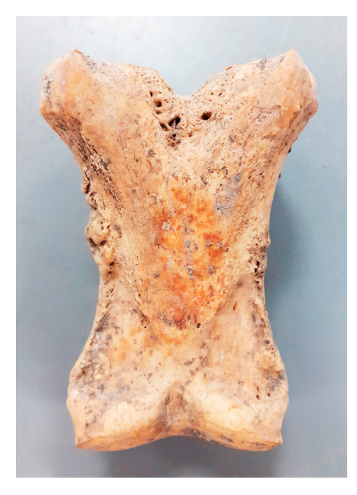
Figure 9. Ostrów Lednicki, site 1. Osteophytes in the area of the ligamentous triangle of the phalanx proximalis (12th c.).

Twenty-four lesions were diagnosed in the finger. They represent 38.5% of the cases recorded in the limb. There were 10 on the phalanx proximalis and 7 each on the phalanx media and phalanx distalis. In the phalanx distalis, generative lesions were observed on the axial and abaxial sides. In one case, they occurred on the ligamentous triangle area of the phalanx proximalis (Figure 9).