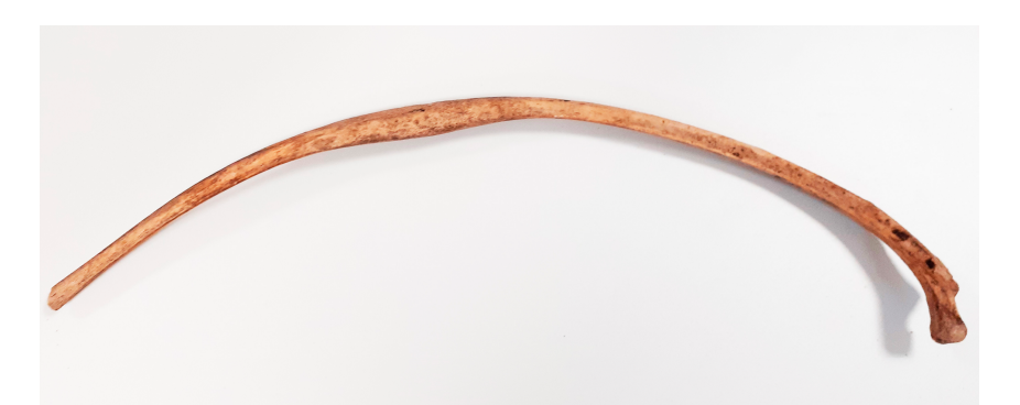
Figure 5. Gdańsk, site 1 (Sukiennicza St.). Post-infectious lesions with visible fistulas (11th–mid 12th c.).