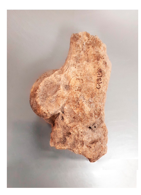
Figure 8. Grodziszcze, site 1. Post-inflammatory fusion of the ankle and heel bones with other tarsal bones observed (1st half 10th–11th/12th c.).

Lesions located in the distal limb were among the most numerous observed in the specimens examined. Among these, 15 cases of fusion of the splint metapodial bones (metapodials) were particularly numerous, with myelomeningocele without ankylosis of the joint being the next most frequent (Figure 7). Among the 17 bone spavin disorders found, only 4 had ankylosis with metapodial bones. In one case, a very rare ankylosis of the ankle and heel bones with the other tarsal bones was observed (Figure 8). The other lesions involved the attachment sites of the interosseus muscle (m. interosseus) and possibly the lateral and medial collateral ligaments.