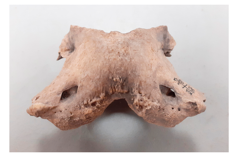
Figure 2. Kałdus, site 2. Enthesophytes on the dorsal surface of the wings and the dorsal arch of the atlas (2nd half 12th–1st half 13th c.).

the thoracic vertebrae (procc. mamillares) and on the spinous processes (procc. spinosi). These led to the anastomosis of the arches (arcus vertebrae) and vertebral bodies (corpus vertebrae) through the calcification of the intervertebral spaces (i.e., thus, the interlaminar ligaments and intervertebral discs) (n = 3). In the lumbar spine, ankylosis of the intertransverse joints (artt. intertransversaria) associated with the calcification of the intertransverse ligaments (ligg. intertransversaria) was identified in four cases. Spondylosis was observed in two lumbar vertebrae (on the ventral surface). In addition, generative lesions were found in the cranial and caudal articular processes. The same type of lesion was noted on the vertebral arches and on the spinous process in two cases. Pathologies within the cervical vertebrae were observed on the dorsal hatch edge of the first cervical vertebra (atlas). These were characteristic osteophytic creations at the attachment sites of the short head muscles (enthesophytes). They were most likely formed as a result of chronic inflammation (Figure 2). The same vertebra also shows an anomaly in the morphology of the notch of the arch, which has a strongly asymmetrical shape.